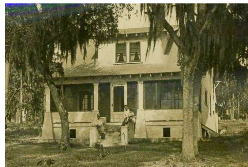
4. B. Mack House 440 Magnolia Avenue Built: 1925 Craftsman Bungalow