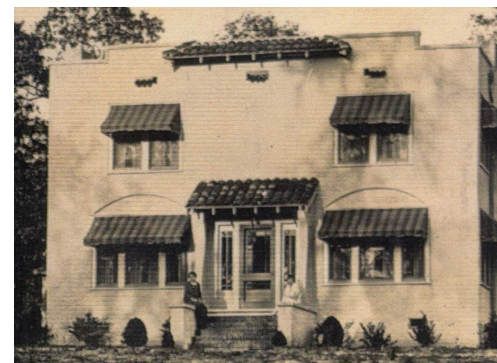
5. J. & E. Bird House 355 Magnolia Avenue Built: 1927 Spanish Revival