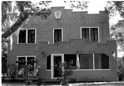
11. R. L. Bloss House 525 Live Oak Avenue Built: 1926 Spanish Mission