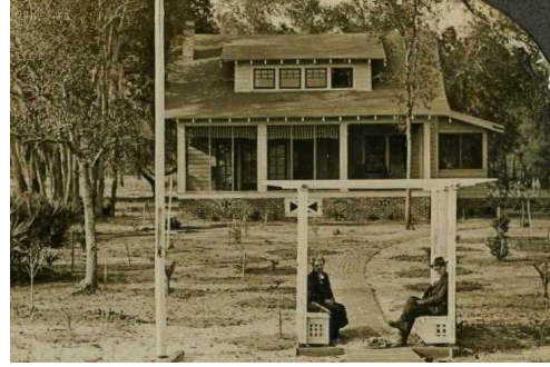
16. Cadman House 561 Lakeview Drive Built: 1927 Craftsman Bungalow