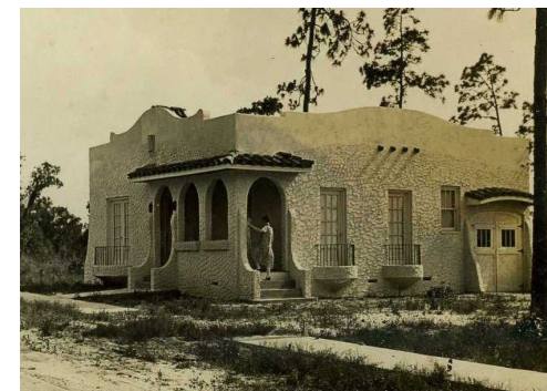
6. Parks House 160 Magnolia Avenue Built: 1926 Spanish Mission