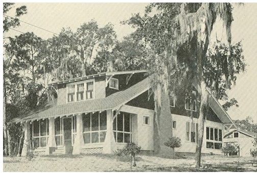
1. Lawrence House 580 Lawrence Blvd. Built: 1921 Craftsman Sears Kit Home