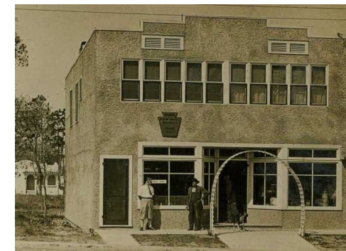
7. Hardware Store Lawrence Boulevard Built: 1926 (Locker Room)