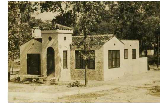
9. Dr. Gamble House 205 Sylvan Way Built: 1926 Spanish Eclectic