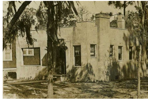
12. Judge McKlem House 320 Oriole Street Built: 1926 Spanish Mission