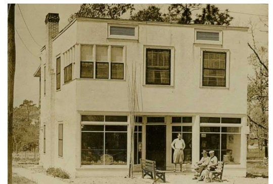
8. Babbit Drugstore Lawrence Boulevard Built: 1926 (Keystone Flooring)