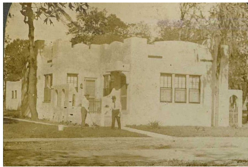
13. Dr. Crawford House 540 Cypress Built: 1926 Spanish Mission