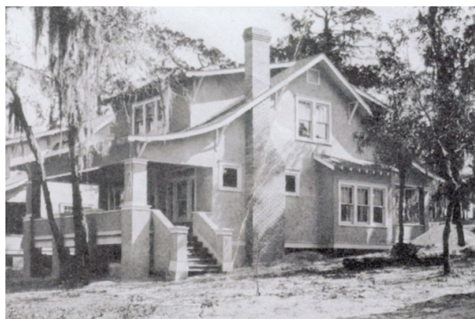
3. Caughey House 450 Magnolia Avenue Built: 1925 Craftsman Bungalow