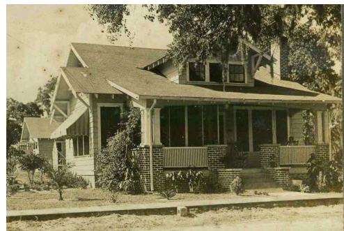
14. Houser House 250 Lakeview Street Built: 1925 Craftsman