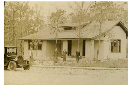
10. S. L. Hart House 350 Sylvan Way Built: 1928 Simple Craftsman