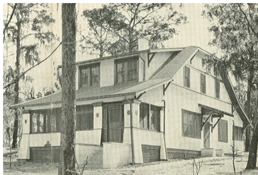
2. J. M. Bergin House 460 Magnolia Avenue Built: 1925 Craftsman Bungalow